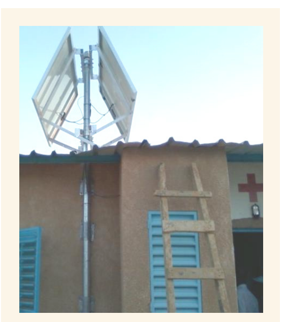
Figure 4. East/West-facing solar generators for the SunDanzer refrigerators in Senegal.

Optimize installed 15 SunDanzer refrigerators in health posts in Podor, Pete, and Richard Toll districts in the north of the country. SunDanzer has a unique design for the solar generator installation—rather than the traditional configuration where both solar panels are placed in a single plane tilted toward the direction of the equator, they have formed their two panels in a tent shape, with one facing east and the other west. (See Figure 4) This configuration allows solar